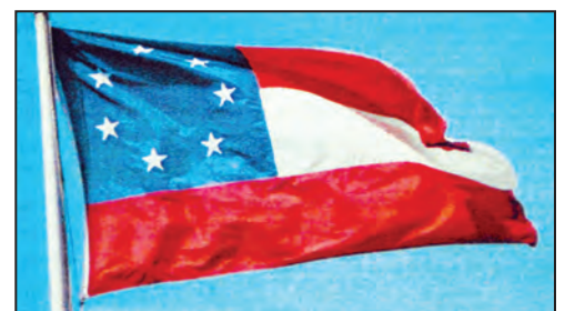
Pictured is the seven-star Confederate flag requested to be flown.